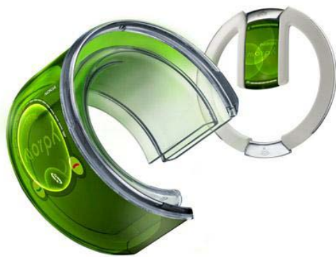
Figure 2: A concept for nanotechnology-enabled mobile phone, the Nokia Morph. Reproduced with permission from 3 .